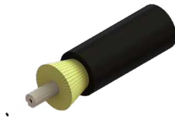
Fig. 1 3.0mm & 4.8mm MDU CABLE