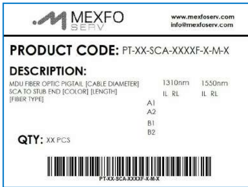
Label located on the individual bag