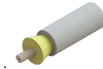
Fig. 1 3.0mm & 4.8mm MDU CABLE WHITE