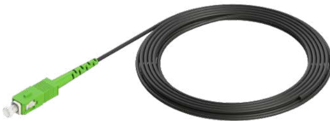
SC/ APC Simplex MDU drop fiber optic pigtail to stub end

These factory-based assemblies are machine polished to ensure excellence in performance intermateability and durability. All pigtailed are video inspected to ensure connector end-faces are free of defects and contamination. Insertion loss is tested using standards-based testing procedures.