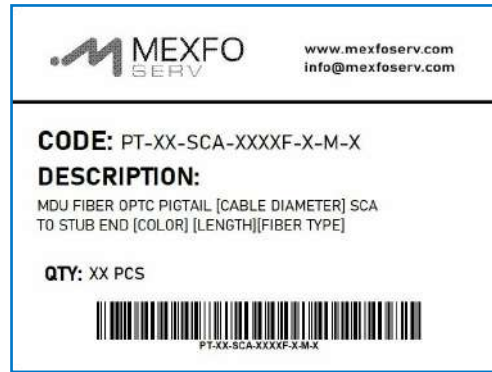
Label located on the master box