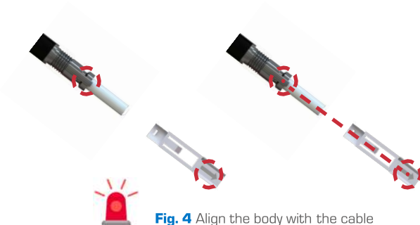
Fig. 4 Align the body with the cable