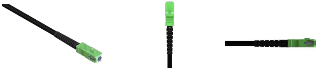
Fig. 7 Place the housing