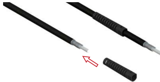
Fig. 1 Boot goes first

Slide the boot over the body of the connector until it snaps into place [Fig.1].