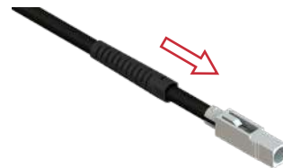
Fig. 5 Place the body according both guides and slide the boot in to the body