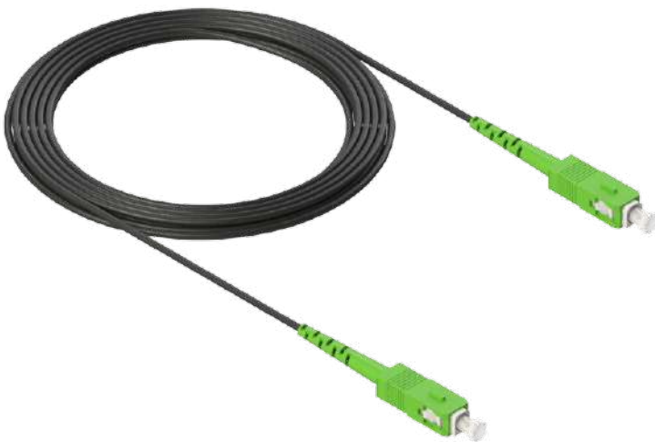
SC/APC Simplex drop fiber optic jumper

These factory-based assemblies are machine polished to ensure excellence in performance intermateability and durability. All jumpers are video inspected to ensure connector end-faces are free of defects and contamination. Insertion loss is tested using standard-based testing procedures.