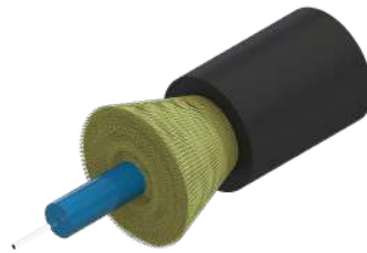
Fig. 1 3.0mm & 4.8mm MDU CABLE