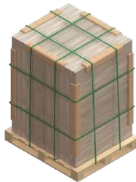
Fig. 3: Pallet packaging