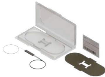
Fig. 1: Individual package