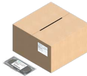
Fig. 2: Master Box

Note: When the shipped quantity is odd, the last splitter can come separately in either blister or